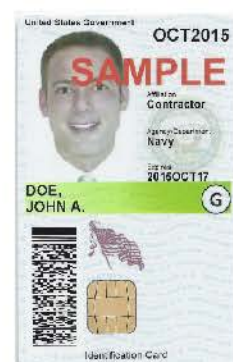
Contractor Homeland Security CIA/FBI International Military Veterans (except for DAVPRM)