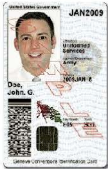
Active Duty Armed Forces