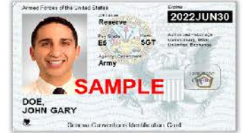
100% Disabled Veteran