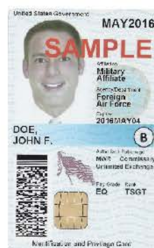
Active Foreign Affiliate (Non-U.S. Citizen)