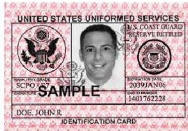
Reserve Retired National Guard Retired