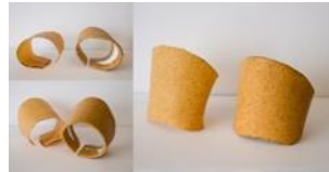
Worbla Techniques- Cuff