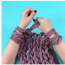
Arm Knitting- Chunky Scarf