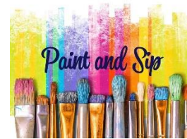
Paint and Sip- TBA